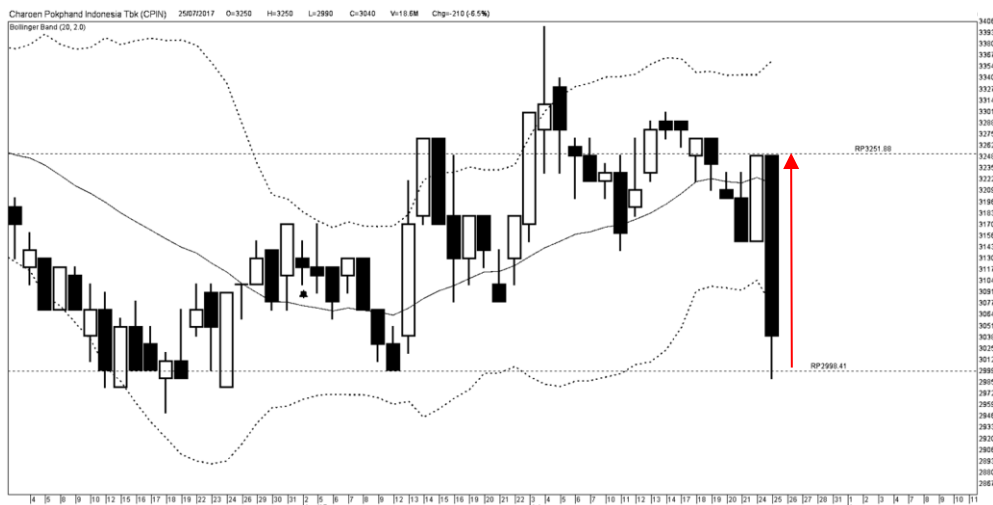
Kinerja saham CPIN

Danareksa research report are also available at Reuters Multex and First Call Direct and Bloomberg